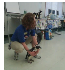
Trainer and Penguin at the Reserve for its Penguin Summer Kick-off

Closer to home, our volunteers interested in research had the chance to attend an orientation at the Field Station on June 23rd. Volunteers can look forward to helping with the RUMFS Otter